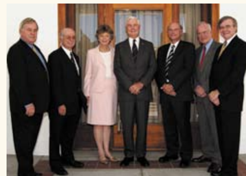
The Menzies Centre for Health Policy was launched by His Excellency, Major General Michael Jeffery AC CVO MC, Governor General of the Commonwealth of Australia, at Old Parliament House, Canberra on 3 March 2006