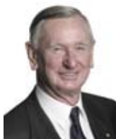
The Hon Sir Daryl Dawson, AC, KBE, CB

This year our Annual Report appears in a new format. It is a lot smaller and easier to handle with the