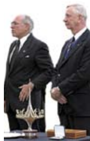
Prime Minister, the Hon John Howard, MP and Sir Daryl Dawson

The Menzies Memorial Trophy was presented by the Prime Minister, the Hon John Howard, MP to Cameron White, Captain of the PM's XI following his team's victory over England.