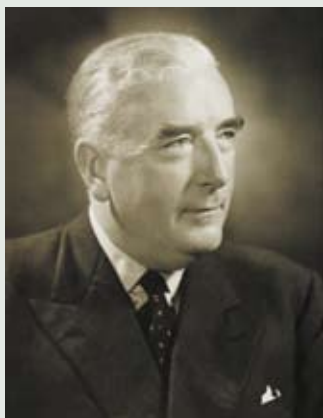
The Rt Hon Sir Robert Menzies, KT, AK, CH, FRS, QC Prime Minister of Australia 1939-1941 and 1949-1966

The Sir Robert Menzies Memorial Trust was formed in 1978 and its public appeal raised $6.2 million. The funds were invested and a non-political, not-for-profit organisation called the Sir Robert Menzies Memorial Foundation was established in 1979.