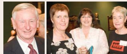
Above left: Sir Daryl Dawson