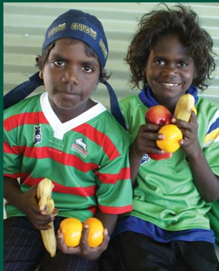
The Menzies School of Health Research thanked families of the Tiwi Islands for their involvement and assistance in research projects over many years.