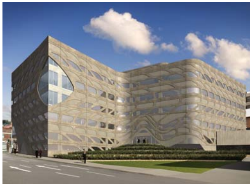
Photomontage of the new Menzies building in Hobart due for completion in November 2009.

The Menzies Foundation continues to be an important stakeholder that significantly enhances the standing of, and contributes to, the Institute's development and strategic direction.