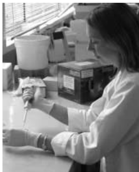
Research in the Menzies Centre's genetics laboratory.

The continued growth and success of the Centre contribute to the Centre's mission to conduct leading edge research.