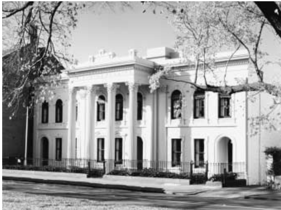
"Clarendon Terrace", 208-212 Clarendon Street, East Melbourne