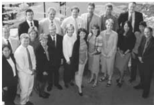
Researchers from overseas and Australia attended the WHO 'Physical Activity Measurement and Surveillance' workshop.

of a suitable questionnaire. Ongoing discussions with WHO continue to solidify the Centre's role in the Western Pacific Region.