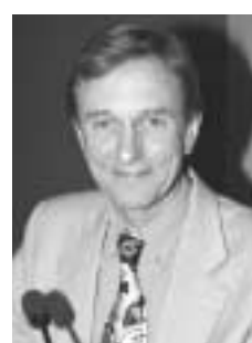
Professor Colin Blakemore

Professor Colin Blakemore, FRS, University of Oxford